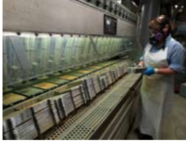
Automatic Plate Stacker

We have applied renewable energy concepts and best practices at our factory to eliminate waste in every area of our manufacturing processes. The result is a product that is truly unique, truly superior in design and performance.