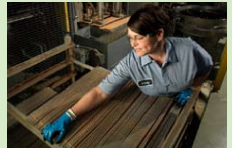
Automated Plate Wrapper

Although there are well over a dozen steps to building Crown Renewable Power Batteries, Crown Battery employs several unique processes that other battery manufacturers cannot match.