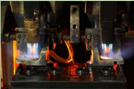
Terminal Post Bonder